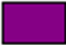
Colour patch 1 st Pioneer Battalion