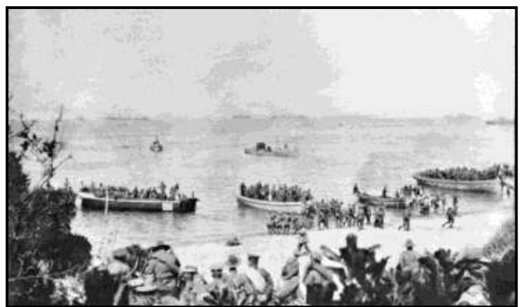
Above: Part of the 4 th Battalion landing at Gallipoli at 8am on 25 Apr 1915.