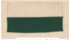
Colour patch : 4 Infantry Battalion, AIF

Honour Boards: WW1 Cumnock Public School Honour Board.