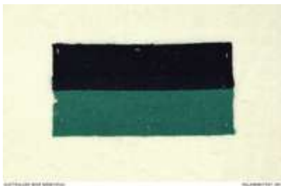
Colour patch : 1 Infantry Battalion, AIF

Honour Boards: Villers-Bretonneux Memorial, France; Australian War Memorial, Canberra, ACT; and Manildra War Memorial Hall, NSW.