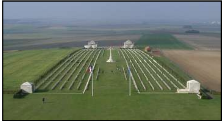
Villers-Bretonneux Memorial, France