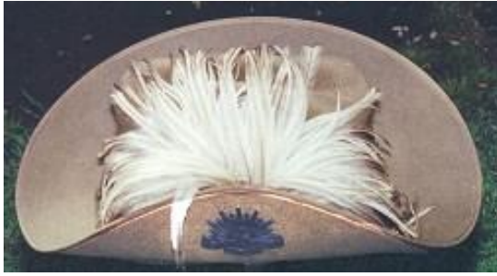
Slough hat with emu plumes & colour patch of 2 nd Light Horse Regiment.