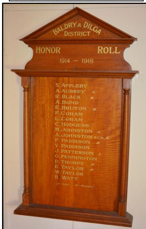
Above - Build-up of supplies, forage, ammunition and stores at Anzac Cove, Gallipoli. Right top: Molong Express & Western District Advertiser – 30 May 1914, p15. Right: Baldry & Dilga District WW1 Honor Roll, Baldry Hall, Baldry, NSW.