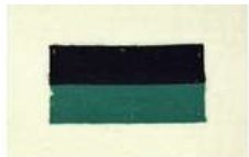
Colour patch - 1 Infantry Battalion AIF