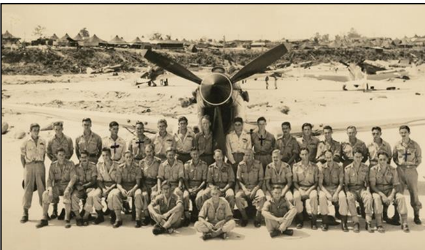
No 80 Squadron RAAF pilots, grouped in front of a Curtiss P40 Kittyhawk. Noemfoor Island, 1944. Those marked with a cross were those known to have been killed. Names of pilots are provided at: www.awm.gov.au/collection/P10029.019

Deepest regret is felt by the district in the death of this fine young man, and sympathy is extended to his parents.