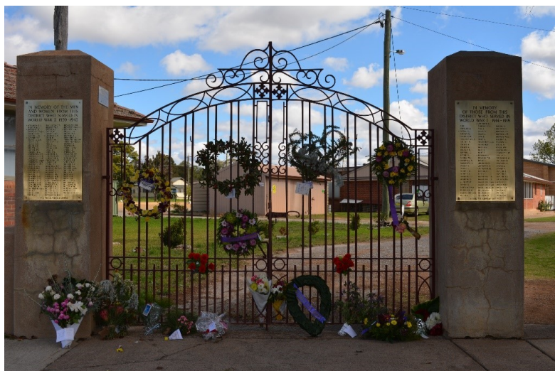
Cumnock War Memorial Gates