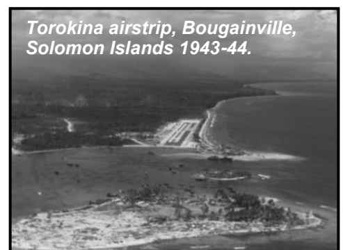
Torokina airstrip, Bougainville, Solomon Islands 1943-44.